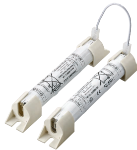
Fig. 2: Stick + Stick