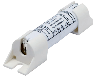
Fig. 1: Stick